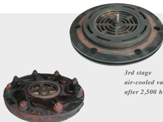
3rd stage air-cooled valve after 2,500 hours